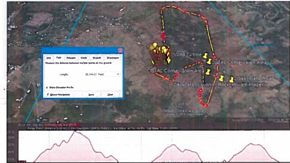
Image 1. COTAL Conservation Area ~28,244 linear feet in total (12,500 linear feet or 2.37 miles for select breaks)