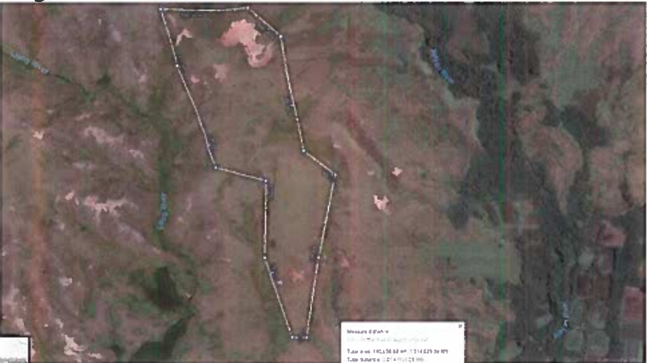
Image 2. As Gadao Plantation, Manell Watershed ~1.25 miles or 6,600 linear feet of firebreak