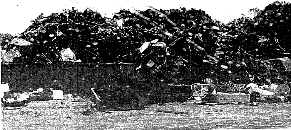
▲ Photo shows waste on the site that is primarily composed of tires, white goods and metallic waste.

As GBB plans for the final closure of the Ordot Dump, part