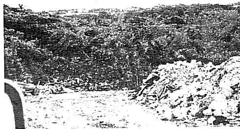
◀ Photo shows the entrance to the ravine where large amounts of household trash and other waste are dumped.

of its responsibility is to identify sources of leachate and other groundwater contamination for mitigation purposes. Because of the findings in their report, the dump sites within the vicinity create a "potential problem for accurately understanding and mitigating the pollution coming from the Ordot Dump itself," the report stated, thus complicating the process for its final closure.