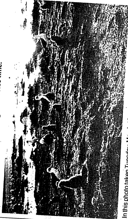
In this photo taken Tuesday, March 19, birds are seen around flooded areas on Sand Island at the Midway Atoll National Wildlife Refuge near the Hawaiian Islands.

"When you start piling the natural catastrophe on top of invasive species invasions and all of these other things, it makes the population a lot less resilient and more susceptible to extinction," he said. "It's rather unfortunate timing, in our eyes. Not that there is ever a good time for this, but there are better times than worse times. And in this era, this is a worse time."